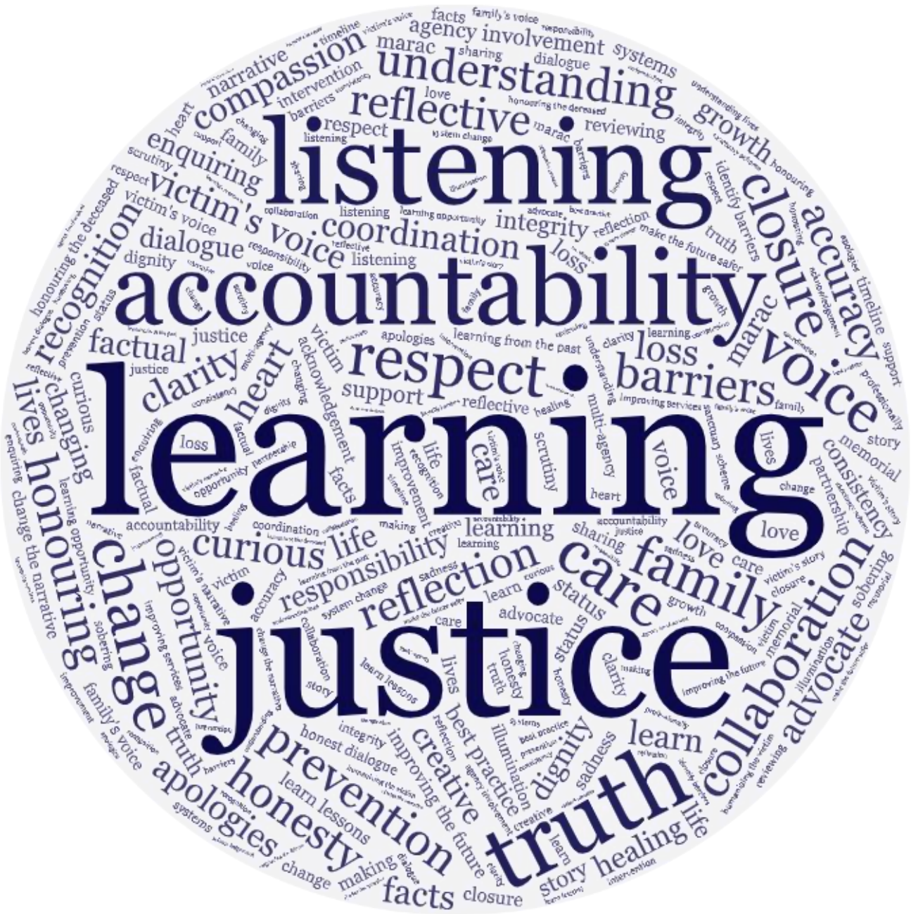
Figure 2: “What do DHRs mean to you?”, word cloud generated from DHR Network pre-launch attendees. (n=65)

AAFDA has a wide-ranging training and professional development offer, for professionals across several agencies and sectors. Given the importance of DHRs in driving improvement in domestic abuse services, a primary focus for AAFDA is the professional development of DHR Chairs and processes through the DHR Network and accredited training.